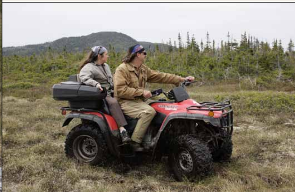
Top: Feeling free Left: Some amazing trails were made Bottom: Watching a moose